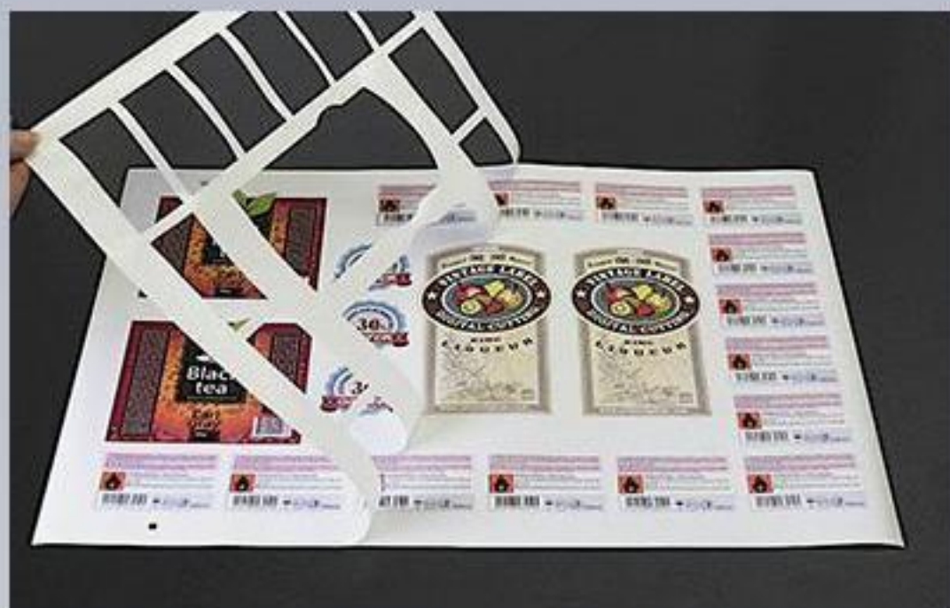
Digital Die Cutter || Perforated Cut