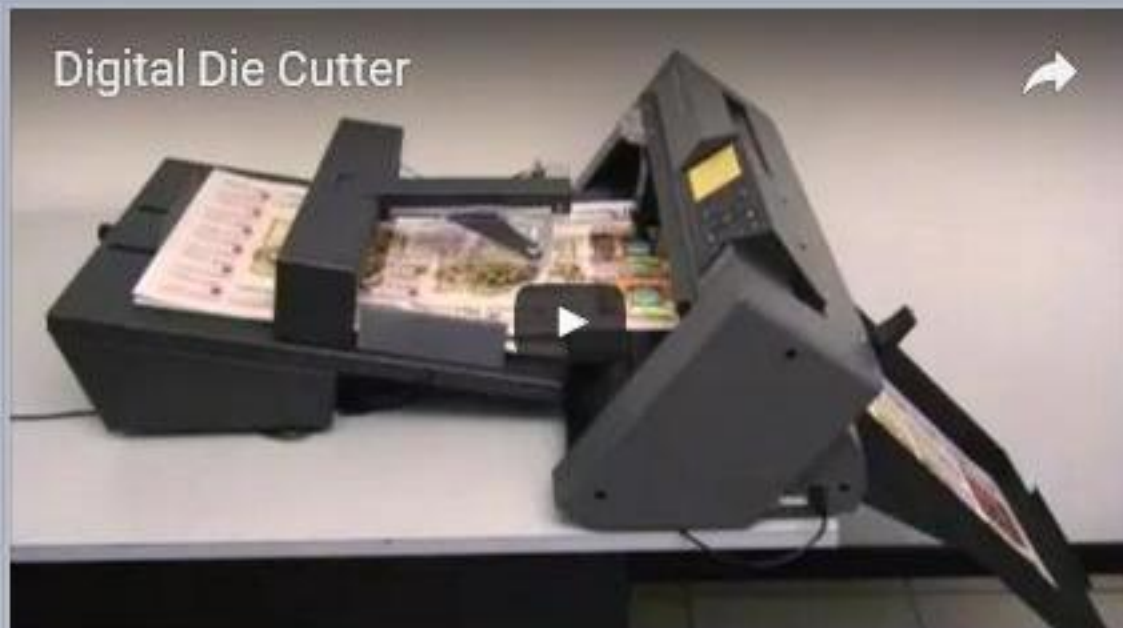
Digital Die Cutter

The software manages the file in Adobe Illustrator format created both by Mac and Pc; it can also manage files created in CorelDraw.