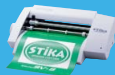
Model SV-8 160mm (8") Cutter