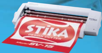
Model SV-15 340mm (15") Cutter

Create Colorful Custom Graphics with Ease