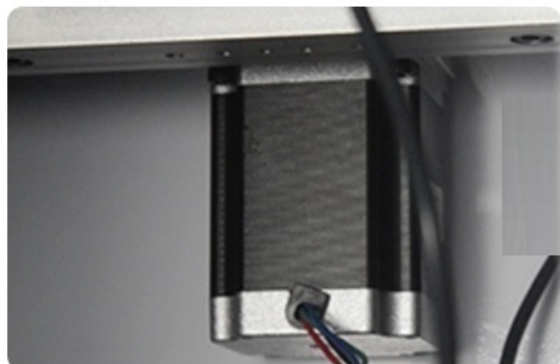
Pulse stepper motor