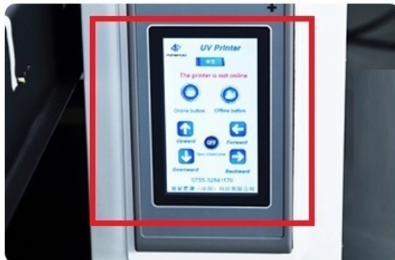
Touch screen control