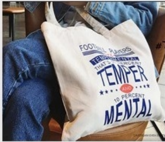
Cloth bag leather bag bag DIY order