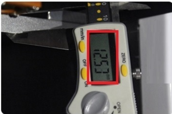
12mm thick auto steel

Automatic access and infrared height measurement, laser positioning, water cooling + air cooling