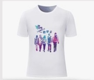
DIY clothes patterns